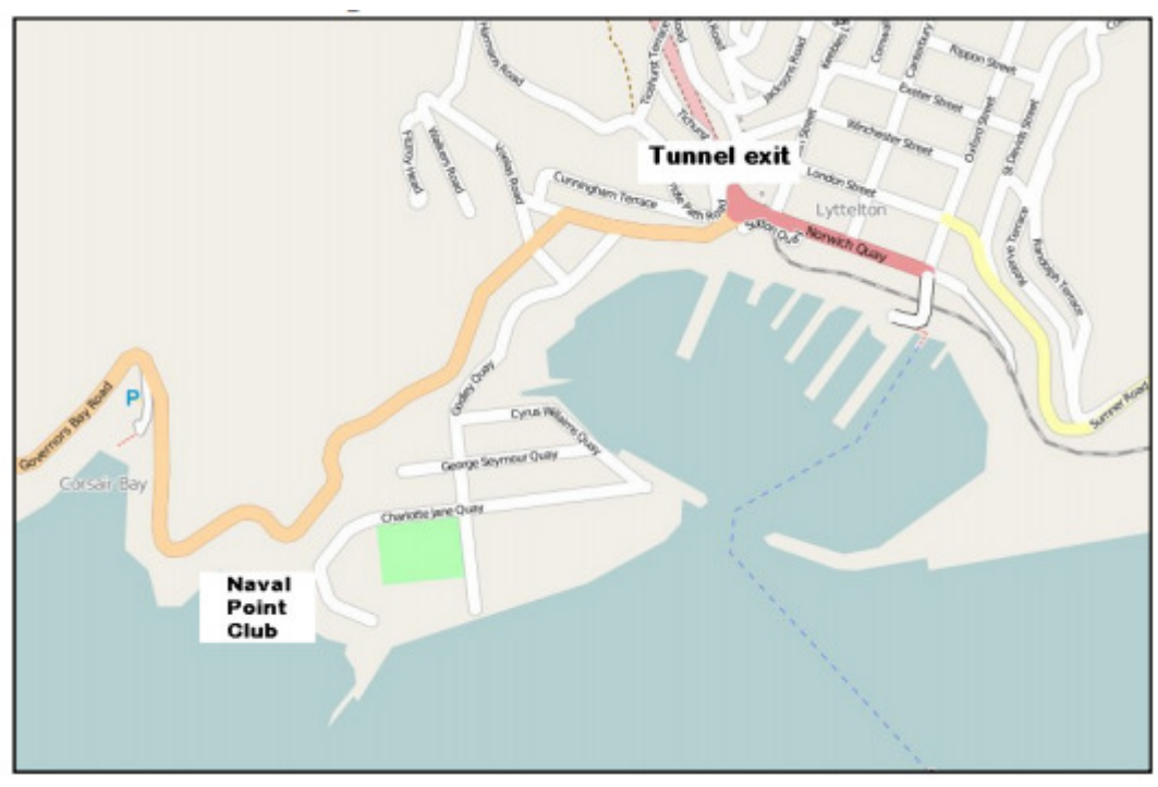
Turn right at Tunnel exit roundabout. Turn first left and follow to recreation ground. Turn right and follow 300m to NPCL gate.